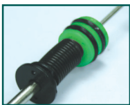
Piston with double O-rings avoids air leakage