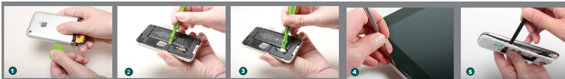
1,2,3. The prying paddle and opening levers are made of Polyoxymethylene (POM) to prevent scratching or chipping your plastic case.