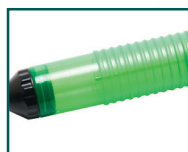
Transparent tube is easy to check solder residue