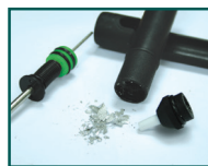
Detachable pump is simple to clear solder residues